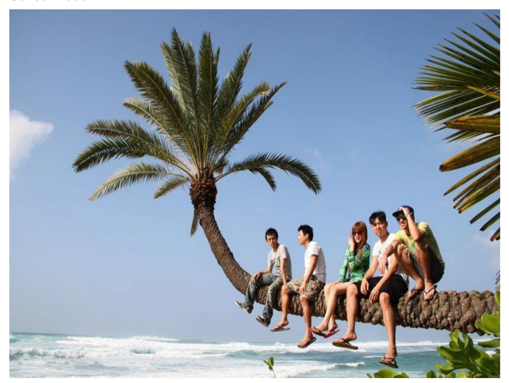
海龜海灘 [Honu] Beach)